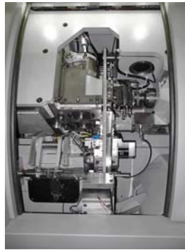
Fig. 2 Accessibility of the tool area