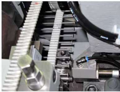
Fig. 3 Conveyor system