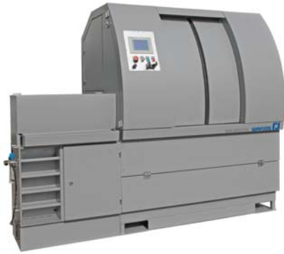
Fig. 1 WAFIOS NAILMASTER